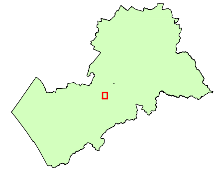
Inset Map: 34 (Saddington)