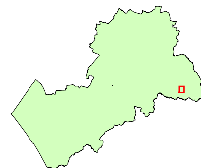
Inset Map: 31 (Nevill Holt)