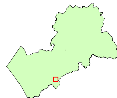
Inset Map: 56 (Husbands Bosworth)